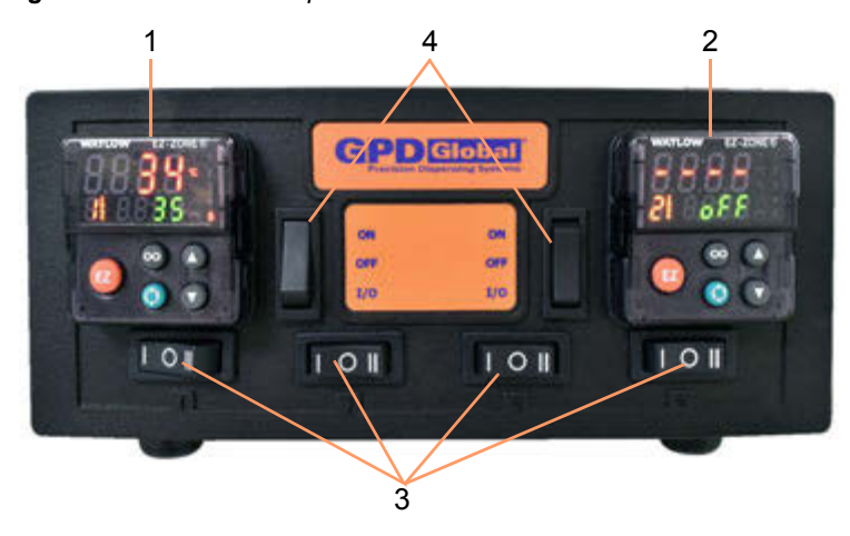
Figure 1: Controller front panel