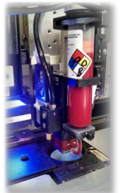
Direct Integration of Jetting Pump

For some 3rd party systems, direct integration of an NCM5000 Jetting Pump may be possible. Your existing software and programming methods still apply, making this the easiest integration method - just swap pumps. Ask GPD Global if your system is compatible with our direct integration configuration.