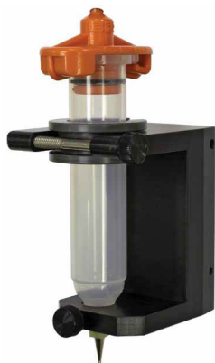
Time Pressure with 10 cc Syringe

Syringe sizes from 5 cc to 30 cc may be used with the included syringe kit.